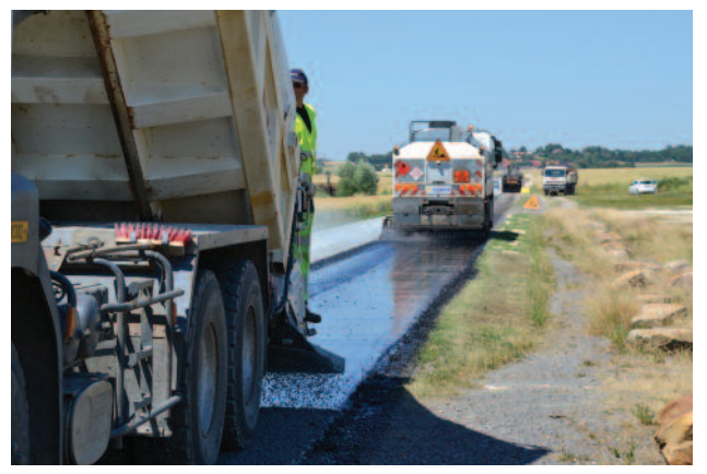
Surface wear dressing