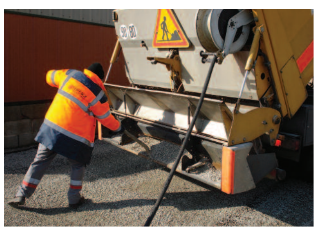
Materials return box