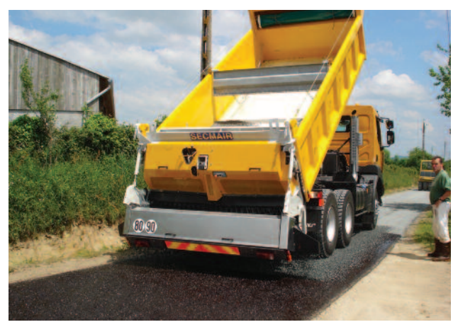
Automatic ARENA 320