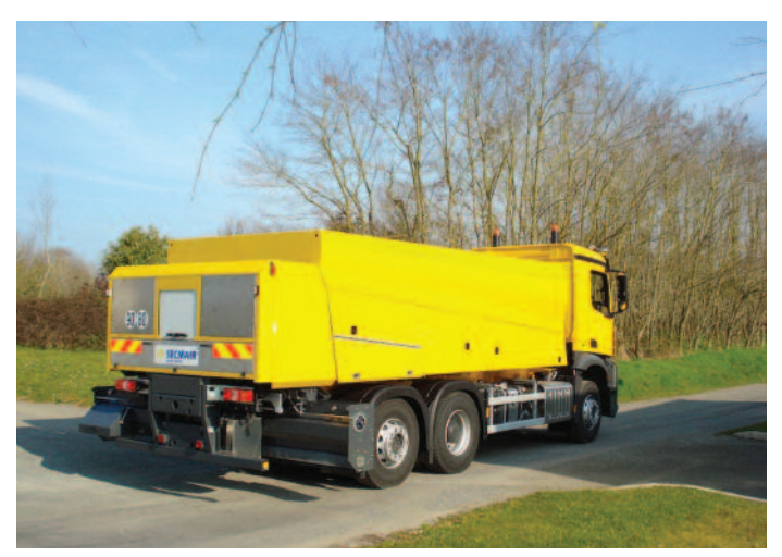
SUPER ARENA 450

PGR 6000 is a rear truck body door fitted with a conveyor belt allowing to lay hot mix or any other type of materials.