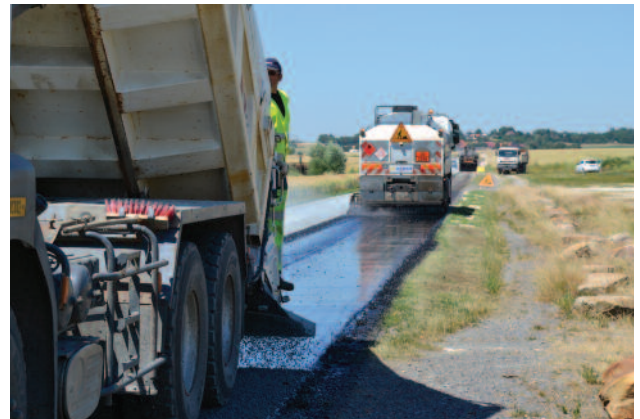
Surface wear dressing