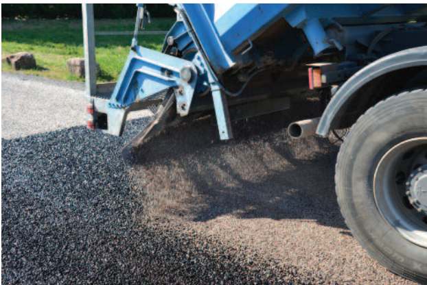
GPB 14 000