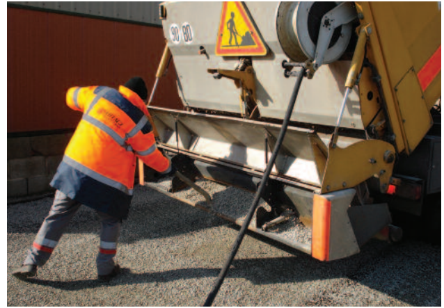
Materials return box