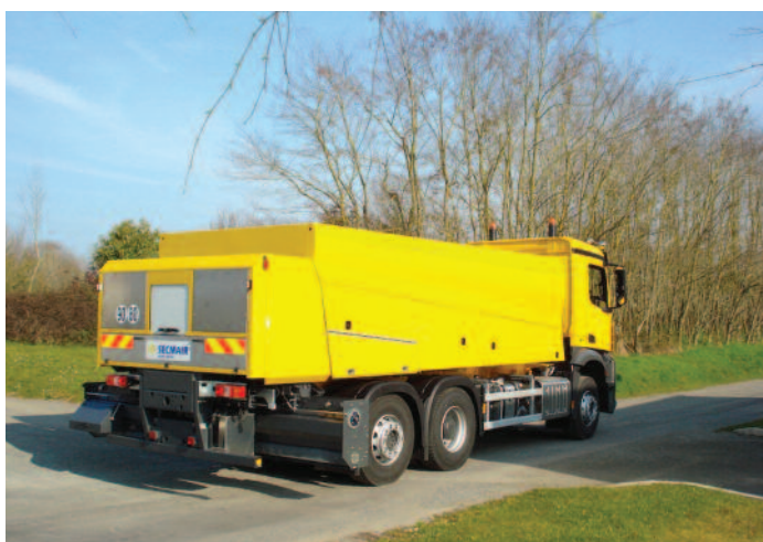
SUPER ARENA 450

PGR 6000 is a rear truck body door fitted with a conveyor belt allowing to lay hot mix or any other type of materials.