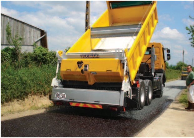
Automatic ARENA 320