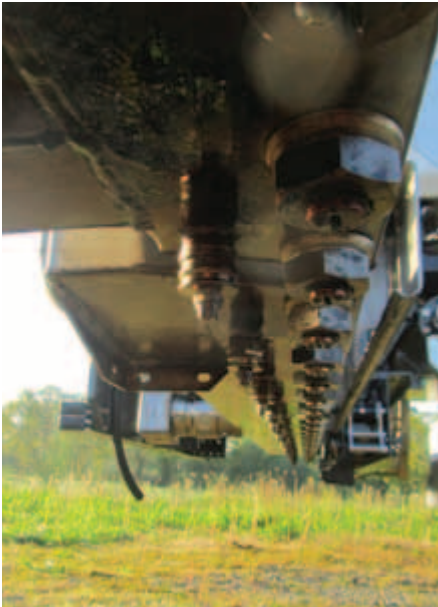
Built-in additive bar (option)