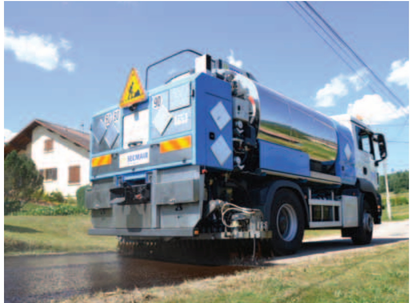
100% warmed binder circuit