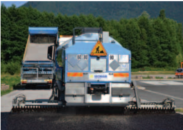
6.20 m telescopic stainless steel bar with safety articulations (option)

The computer is pre-set to house a full traceability function - temperatures, works productivity, dosage, etc.