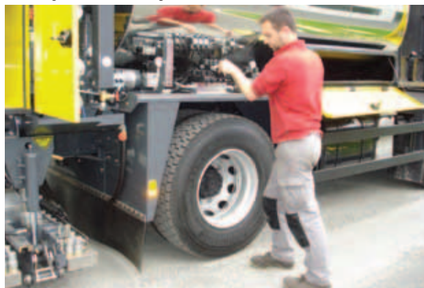
Servicing access from the ground