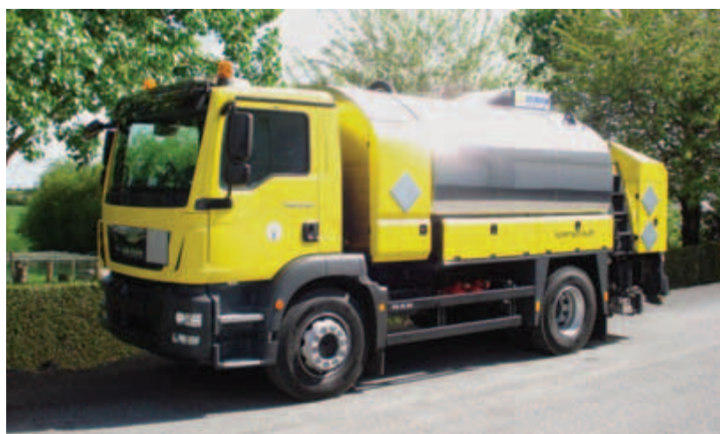
Short wheelbase and easy to use